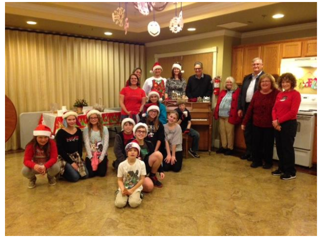
Members of DeBows UMC and Cornerstone Presbyterian Church at Care One in Jackson.