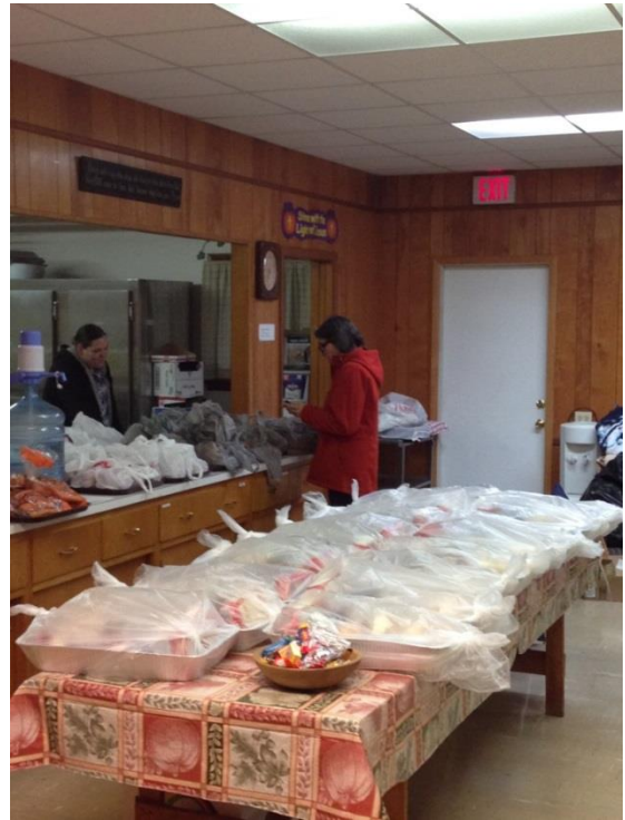
Thanksgiving preparation kits being readied for distribution.

While the DeBows Food Pantry is active year round with twice a month distribution, they went the extra mile during November and Thanksgiving in particular. In November, the Food Pantry served 136 adults and 54 children, representing 64 families. We received 850 lbs. of food from various sources and want to acknowledge Tom & Karen who donated 30 thanksgiving dinner preparation kits that were distributed along with turkeys purchased from the Foodbank.