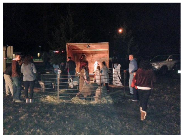
The stable with some of the animals in the foreground.